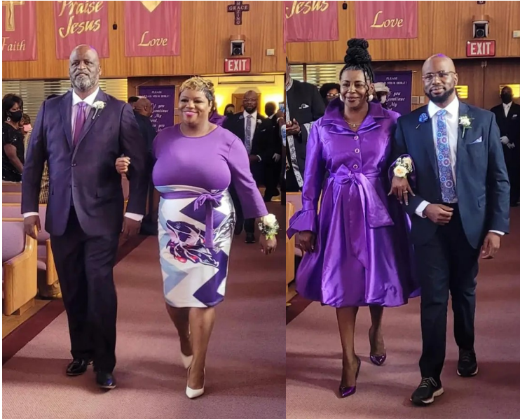
Our New Pastor and First Lady