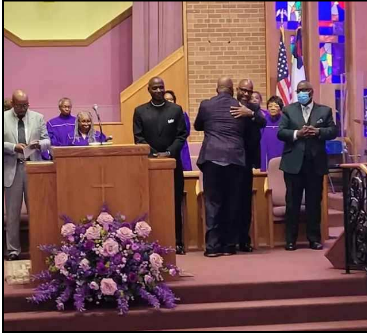
A Warm Greeting