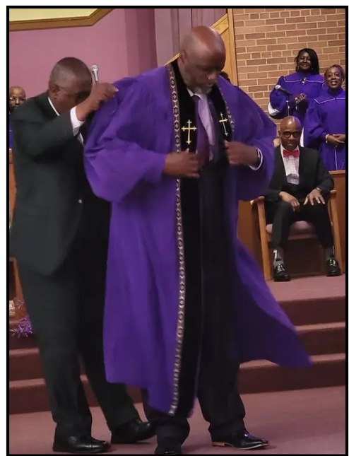
A Sacred Robe