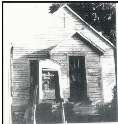
Belmont Street, Hamtramck, MI