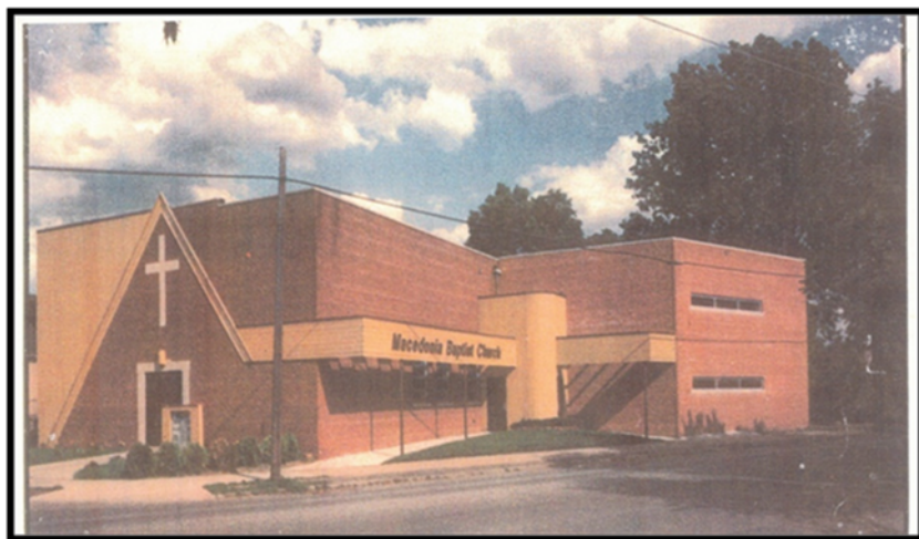
Evaline Street, Hamtramck, MI